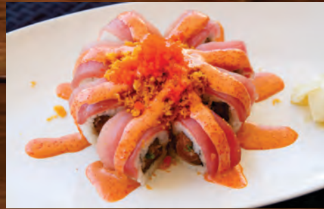
PINK LADY ROLL