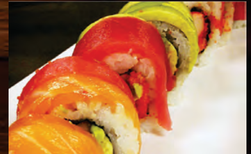
3'S COMPANY ROLL