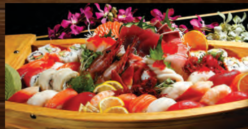
PARTY BOAT (FOR THREE)