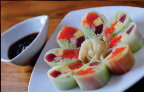
CURI MAKI ROLL