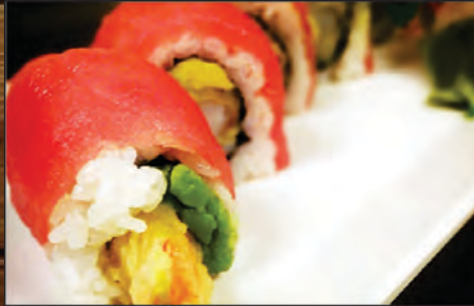
NO NAME ROLL