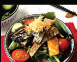
SALMON SKIN SALAD