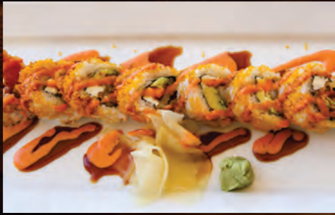
SHRIMP TEMPURA ROLL